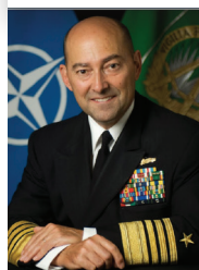
Admiral (Ret.) James Stavridis U.S. Navy, NATO Supreme Allied Commander, 2009-2013

“ We must ensure that federal nutrition programs continue to provide fresh and nutritious foods for children, during the pandemic and beyond.”