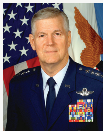
General (Ret.) Richard Myers USAF, Chairman of the Joint Chiefs of Staff, 2001-2005

imperative of proper nutrition for over a decade. While meaningful progress has been made, COVID-19 has brought attention to many shortcomings in federal nutrition programs. We are again calling for Congress to invest in the health of our youth, by strengthening and modernizing school meal programs to meet current and future challenges. It is critical to recognize that obesity can often be a manifestation of malnutrition, which stems from a lack of consistent access to fresh and nutritious foods. Increasing children's access to these foods now can help America recover from present challenges, and bolster our national security in the future.